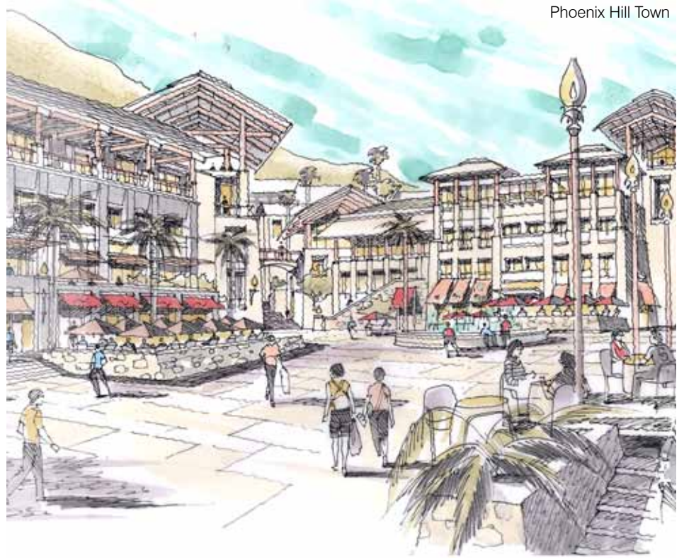
Phoenix Hill Town