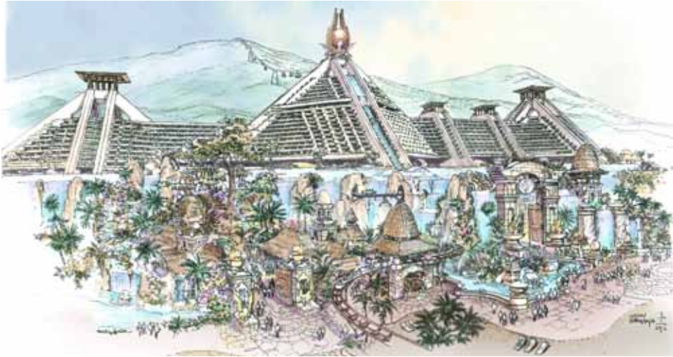
Water Park Resort Themed Hotel Interior