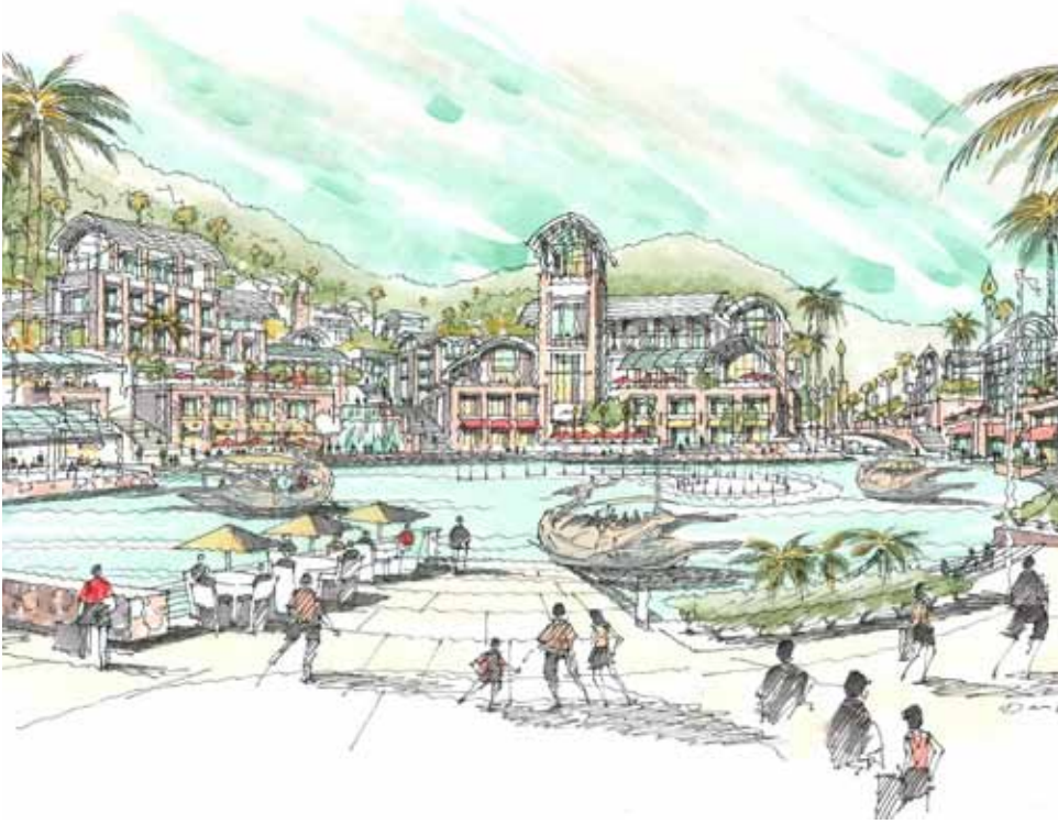
Phoenix Water Town